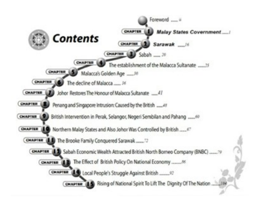
Fig. 1. Content of the comics during the Malay States and British Occupation

Figure 1 displays the content found in the comics' titled 1Malaysia. The comics explain the events and illustrate the scenes during the Malay States including the Malacca Sultanate and the narration is continued towards the struggle during the British occupation. The comics consist of fifteen chapters.